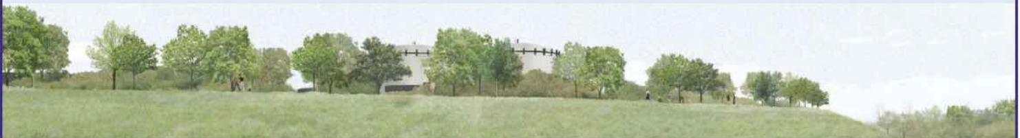
Computer-generated image showing indicative ground level view of the proposed facility with mature planting on top of earthwork bank

For more information please get in touch: